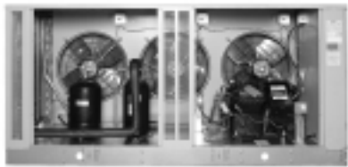
REMOTE CONDENSING UNIT WITH FREESTANDING LOWSIDE. Machine side for indoor & outdoor use.