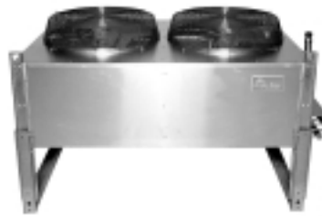
REMOTE CONDENSER Compressor and components are rail mounted on a common skid with evaporator section. Machine side for indoor & protected use.